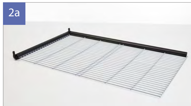
Slide the roof panel into the roof profiles. Make sure the thick vertical wires are facing downwards. Attach another top corner piece on the other side of the short roof profile.