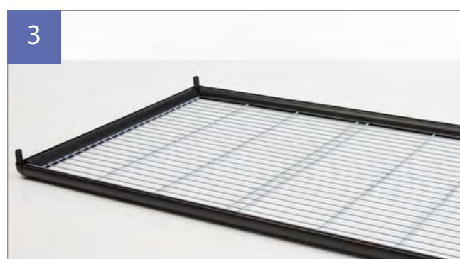
Slide the remaining roof profile - 774 mm over the roof panel and attach a corner piece.