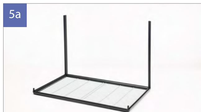
Attach 2 side profiles of 512 mm (f) on the roof. Slide the back panel (b) into those 2 profiles. Make sure that the vertical wires of the panel are facing outwards.