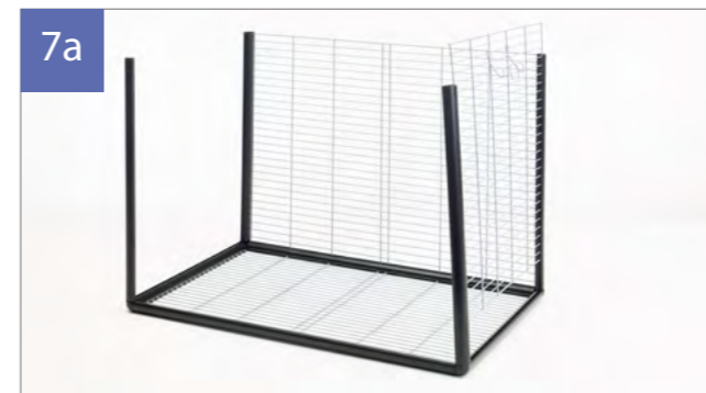
Slide the 2 side panels (d) in the vertical profiles on both sides. Make sure that the closures are facing outwards. Finally, slide the front panel in the vertical profiles. Make sure the door is facing outwards.