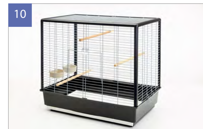
Install the accessories and your cage is now ready for use.