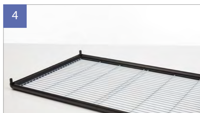
Finally, slide the last roof profile - 440 mm over the roof panel and attach the last top corner piece. The roof of the bird cage is now installed.