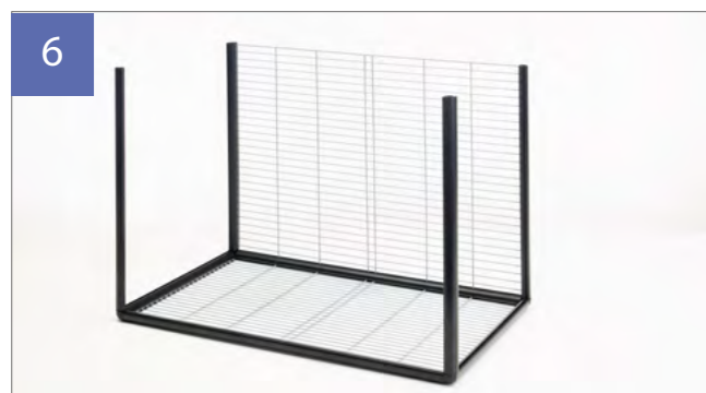
Assemble the 2 remaining side profiles (f) on the roof.