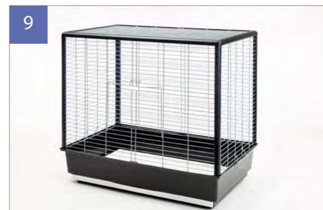
The wire part of your cage is now assembled. Turn the wire part upside down and put in on the plastic tray.