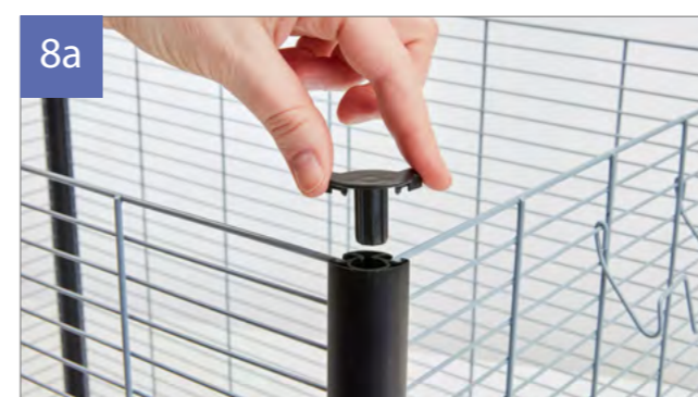
Fix the 4 corner pieces (h) on the vertical profiles.