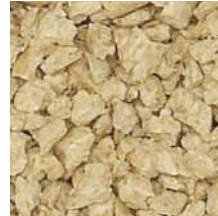
Granulate - clumping -